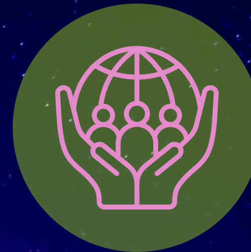
AI+ in Social Impact (Healthcare & Education)