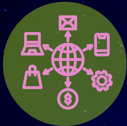
AI+ in Marketing, Retail & eCommerce

We welcome below categories AI +applications (but not limited to)