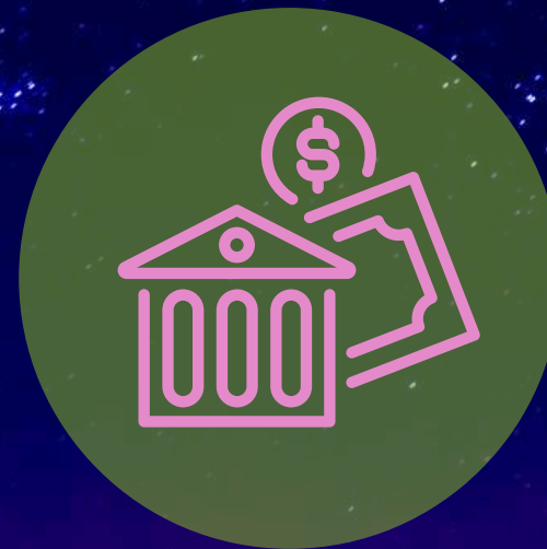
AI+ in Finance & Insurance