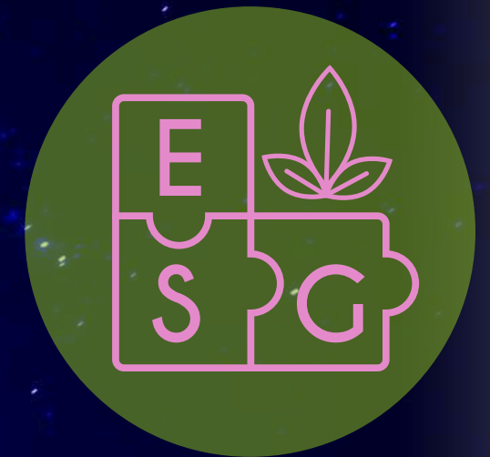
AI+ in ESG