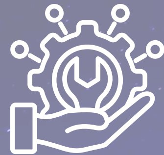
Tech Solution Providers

Recognizes outstanding AI application projects jointly developed by tech companies and clients, celebrating impactful collaborations that showcase either a single transformative project or a broader AI strategy that drives innovation and growth. Nominations can be for a single project or an overall strategy. Winner should demonstrate how AI+ solutions has brought cost benefits, improved internal processes and created new opportunities.