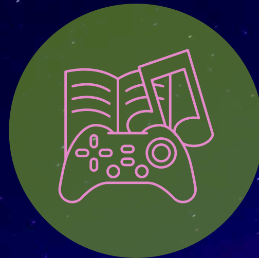
AI+ in Gaming & Entertainment